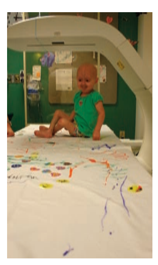
Child on the DXA scanner; this machine measures bone density and body composition

calcium for proper bone growth, it is recommended that children ingest at least 400 IUD of vitamin D per day. Since it can be difficult to get adequate vitamin D in food alone, supplementary vitamin D (eg., children's multivitamin tablet) is recommended by the American Academy of Pediatrics.